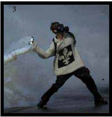
Tear gas canisters can be thrown away from the crowd, but be careful. They are extremely hot, and can burn your hands.

to intimidate and scare people away; Surprise attacks by troops hidden in reserve; Surround and Isolate Entire Crowds – Sometimes not allowing people to leave or enter.